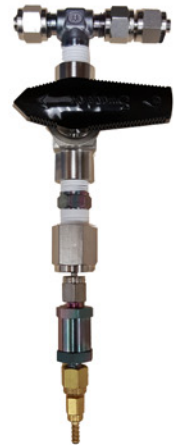
Passivated Fixed Bypass CV Assembly 3.2 LPM