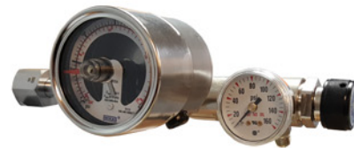
LoGas™ Low Pressure Warning Sensor