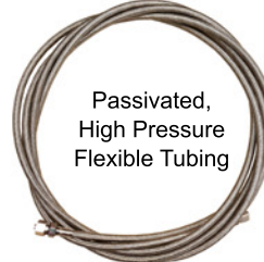
Passivated, High Pressure Flexible Tubing