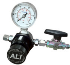
1-Stage Passivated & SS Pressure Regulators

PRODUCT BRIEF PASSIVATED HIGH PURITY GAS ANALYSIS HARDWARE