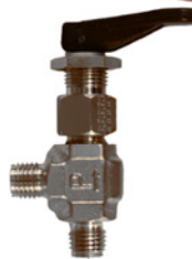
Passivated & SS Toggle Valves