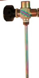
Passivated Needle Valve - Burst Disk - Dip Tube Assemblies