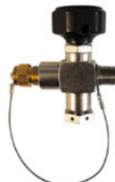
Passivated & SS Needle Valves with Burst Disk