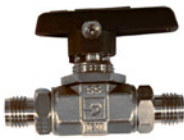
Passivated & SS Ball Valves