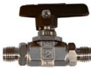
Passivated & SS Venting Ball Valves