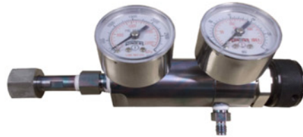
2-Stage Passivated & SS Mini-Pressure Regulators