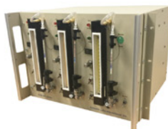
GAS-5XLT Detector Tube Analyzer