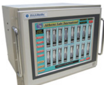
DSA BLACKBOX™ Data Station