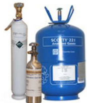
Calibration Gases (available in various sizes)