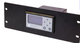
GE DEW IQ Moisture Analyzer