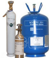
Calibration Gases (available in various sizes)