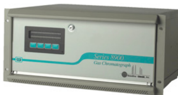
BASILINE TSC 8900 Total Sulfur Content Analyzer