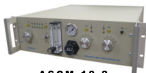
ASCM-10-2 Automated Sample Line and Calibration Control Module