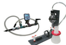
ZCheck 5XLT Passivated Check Valve Assy & Zahm & Nagel % Purity