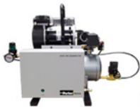
Zero Air Generator Parker Balston with GAST Compressor & Auto-Drain.