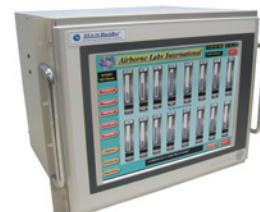
DSA BLACKBOX™ Data Station