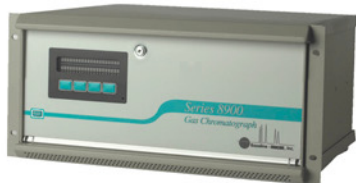
BASILINE BAM 8900 Aromatic Hydrocarbon (Benzene) Acetaldehyde (AA), Methanol (MeOH)