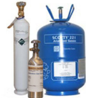
Calibration Gases (available in various sizes)