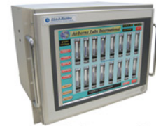
DSA BLACKBOX™ Data Station