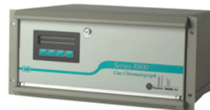
BASELINE TSC 8900 Total Sulfur Content Analyzer