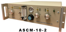
ASCM-10-2 Automated Sample Line and Calibration Control Module