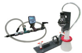
ZCheck 5XLT Passivated Check Valve Assy & Zahm & Nagel % Purity