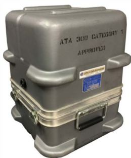
CIB CYLINDER SHIPPING CASE